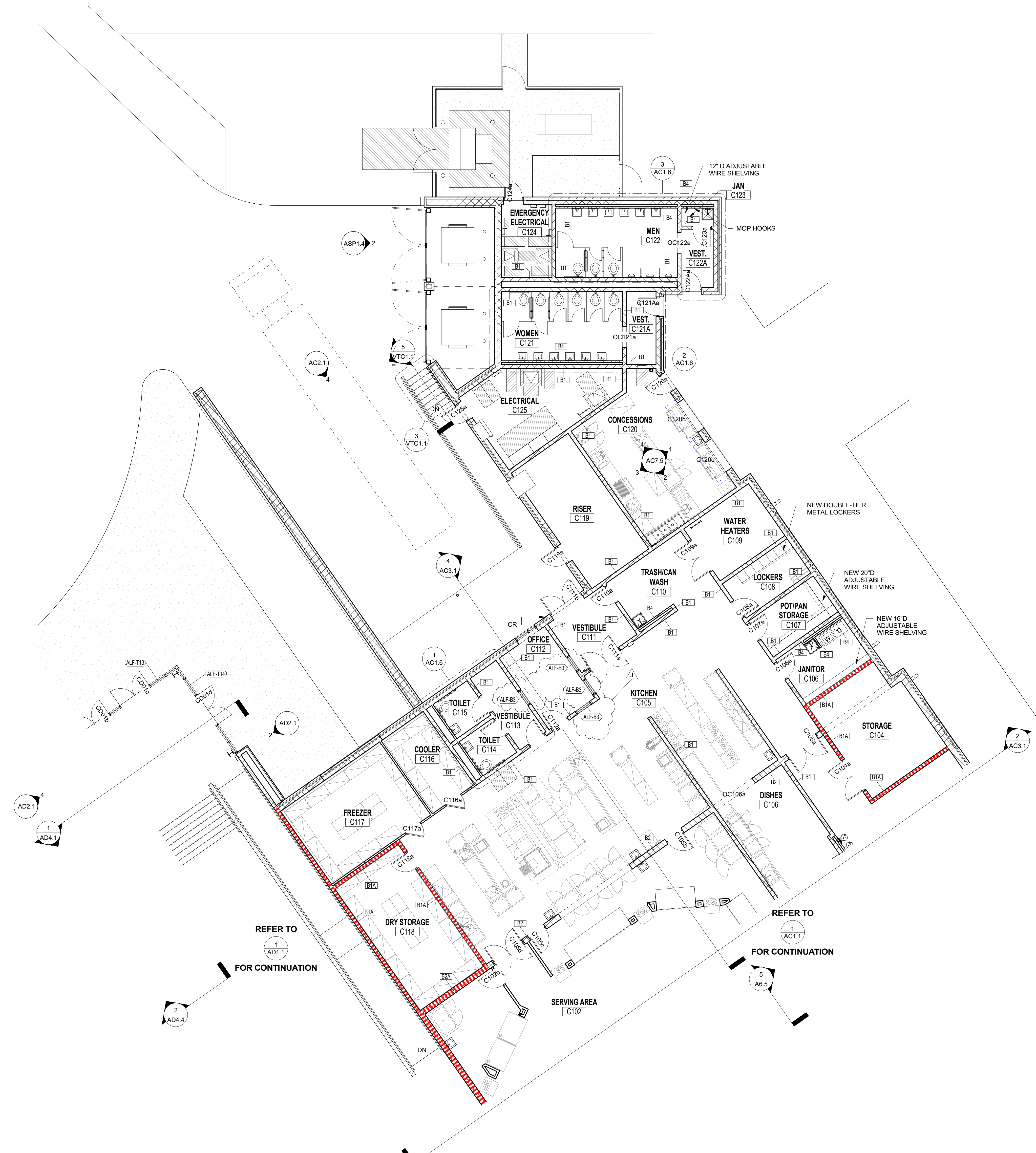
1 C2 (KITCHEN) - FIRST FLOOR PLAN 1/8" = 1'-0"